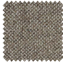
tobacco 111 (new colour)

Please note: colours may vary according to your screen settings.